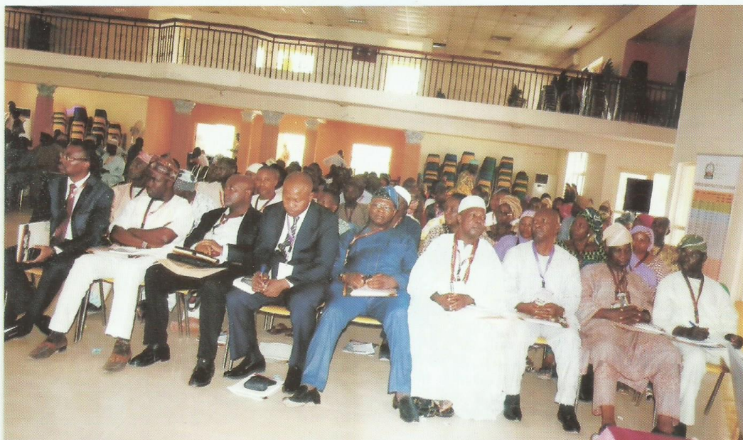
Cross section of participants at the forum

Speaking on the import substitution strategy also known as Backward Integration Programme (BIP), Dr. Busari noted that, "companies granted approvals for importation of sugar are expected to commence investing in backward integration projects immediately. Existing refineries are expected to begin sourcing their raw materials (raw sugar) requirement from their local production within 3 years of plant commissioning".